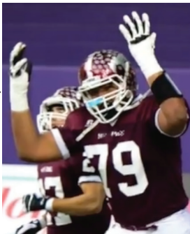
As a Mustang, graduating in 2017