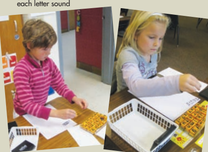
2nd grade students now have a variety of materials that offer different ways to work on spelling words and word families

Your Foundation Gift... your legacy to Mount Vernon Schools