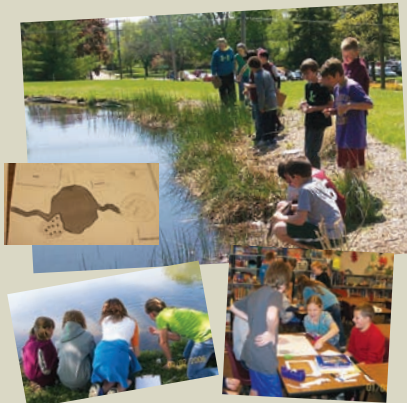
These are pictures of Mrs. Poduska's students trek to Ink Pond. What excitement! The poster is a completed land use map of "Dragonfly Pond" and the classroom picture is of the collaboration of a group in designing that land use. We will also look at rainforests and students will make clay models (brilliantly colored) of the insect/ amphibian/plant they "discover" as a new species which solves a major health or environmental problem facing us today.

The MVCSD Foundation Educational Excellence grant allowed JoAnn Gage to purchase 10 licenses for InDesign CS5.5, the software used by most professional magazines and newspapers for layout and design. They use InDesign for layout, and use it in Advanced Composition, for creation of The Mustang Moon (our student