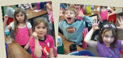
Kindergarten and 1st Grade students enjoyed learning "Sound Moves" which are fun movements associated with each letter sound