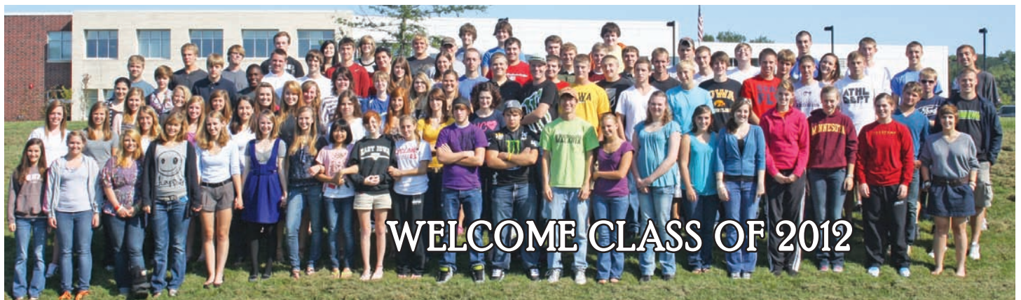
Welcome to new alums from the Class of 2012. Approximately 92 seniors graduated May 27th.