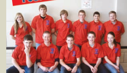
High School 'Fruit Fusion' entrepreneurs