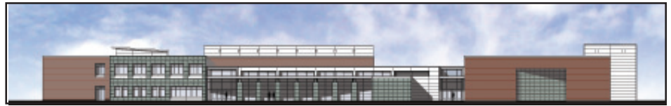
Top: architectural rendering of new high school